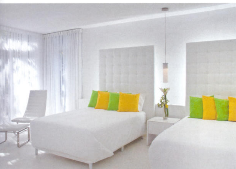
Above: contemporary white chic presides at Le Caméléon on Costa Rica's Caribbean coast.